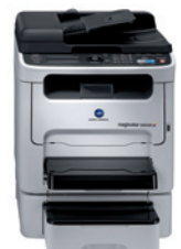
magicolor 1690MF-dt with duplex unit and lower paper feeder