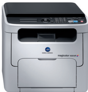
magicolor 1680MF standard