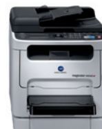
magicolor 1690MF-d with duplex unit