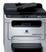
magicolor 1690MF standard